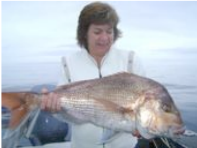
MacFlasher rigs have been working on the big snapper out on the deep fowl