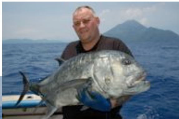
'Bushie' and a 25kg Giant Trevally

If you are keen on a winter getaway focused around some tropical gamefishing next year then put your name down now!!