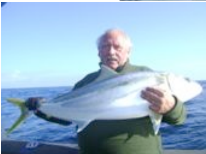
His tackle collection includes over 100 rods and reels and a fair few of them have been loaded aboard Epic on Boulders monthly trips with us. Boulder has got into plenty of good fish himself.